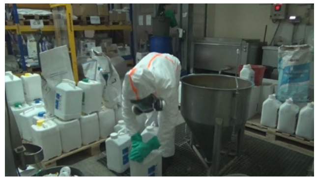
Figure 2. Exposure situation during pesticides preparation operation.

Our results coming from the various wine-companies show that conducting a collective action based on real personal problematics and occupational preoccupations could support transformations of exposure situations. These transformations were made possible by a collaborative process of linking public health issues with occupational health issues and co-construction between ergonomics researchers and farmers. There are many pesticides exposure situations linked to the use of plant protection product (Figure 2) but, to select the pertinent determinant to transform into actions (organisational's measures, technical's measures and human's measures) it is necessary to let the farmers design the transformation or to let them to contribute to the design of their work activity (material, prevention rules, etc.). In our opinion, this constitutes a path to follow for accompagning farmers to develop ways to maximize their activity reducing occurrences of pesticides exposures.