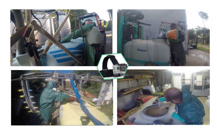
Figure 2. Work-sequences video.

Learning processes developed and encountered along the collective action, including work-group and person centered approach, are based on various intermediate objects like work-sequences video (Figure 3), pesticides collective measures (Figure 4), work simulation in work-group (Figure 5). This is how the members of the collective (farmers and researchers) have developed operational learning processes which will help to adapted their future action strategies regarding activity transformation and risk prevention.