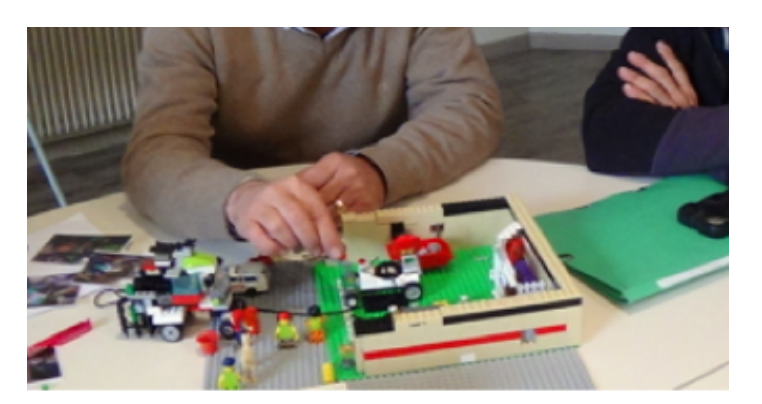
Figure 4. Work simulation.

To transform pesticides exposure situation we can first recommand to better include the real activity of farmer inside the risk evaluation. Understanding the real work and the real activity of farmers has allowed to better characterize exposures and their technical, organizational, human and social factors at different scales. In fact, exposure to pesticides and the various exposure factors (physical, social, psychosocial risks) can be characterized by documenting both the professional and private activity of farmers (in terms of treatment operations and in terms of farm management activities) (Figure 6). In this case, developping "discussion spaces", based on an analysis of the real activity of farmers, and supported by intermediate objet (vidéo, measures, etc.), permit to better document exposure and prevention in terms of factors and variability.